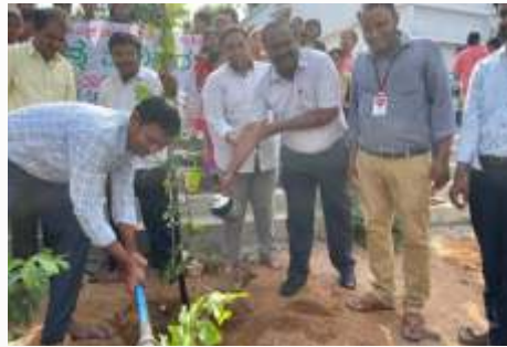
World Environmental day