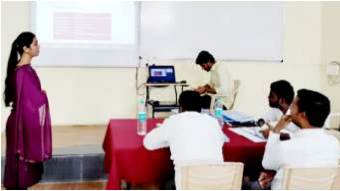
MBA Final Year Students Project Seminar Presentation