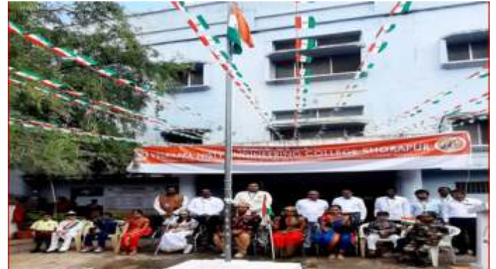
On 13th, 14th & 15th of August 2022, Celebration of Azadi Ka Amrit Mahotsa "Har Ghar Tirang Concept"