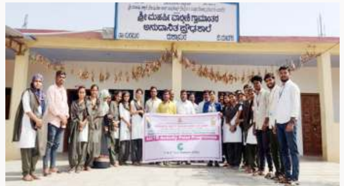
On 23rd May 2022, AICTE Activity by VNEC Students