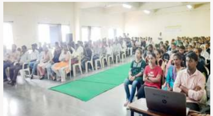
On 30th May 2022, organised a CET/NEET/JEE coaching for PUC Students By VNEC Faculties.