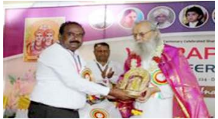
On 25th & 26th June 2022, Opening ceremony of Poojya Sharanbasvappa Appa Auditorium Hall & "JnanaManthanTechnical Fest"