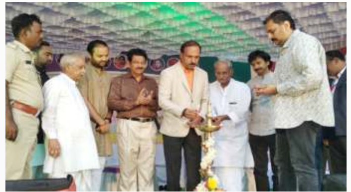
On 26th June 2022, Opening ceremony of Cultural Fest Activities under "JnanaManthan TechFest"