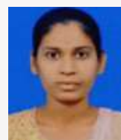
Priyanka III SEM