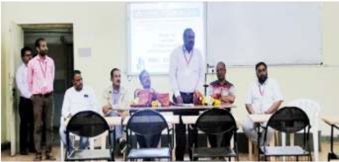
On 09th July 2022, Walk in Interview by RNC Consultancy