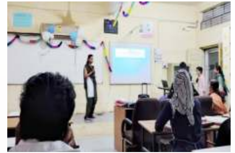
Constitution Day Monday, 26 November 2022