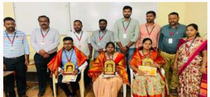
On 07th Sept 2022, Award Ceremony to Our Faculty members by Sharnbasva University, Kalaburgi in their respective PG-Program.