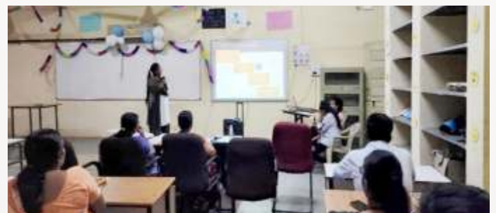
Students of VNEC, of ECE dept presenting PAPER during the international conference at SUK University