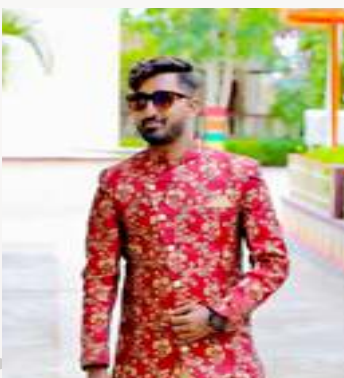
MBA FINAL Year Students has won 1st Prize in Ethnic Show in Jnanamanthan-2022 TechFest.