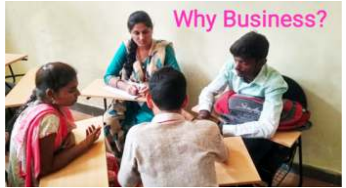
Group Discussion Activities for MBA Students