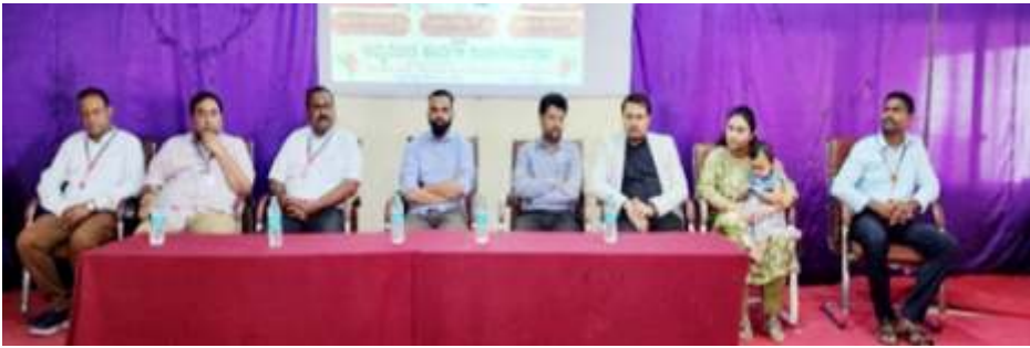
Blood Donation & Health Camp Monday, 10/11/2022