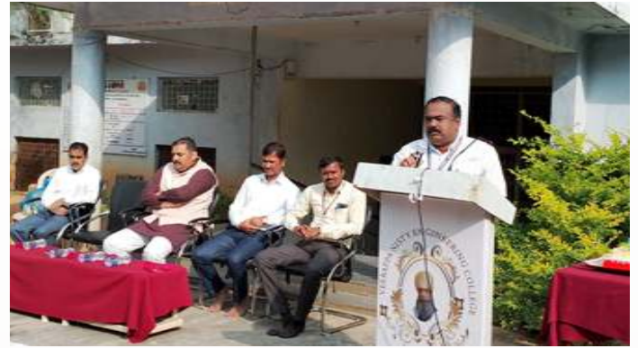
On 01 Nov 2022, Celebrated Karnataka Rajyotsava @ Veerappa Nisty Engineering College Shorapur.