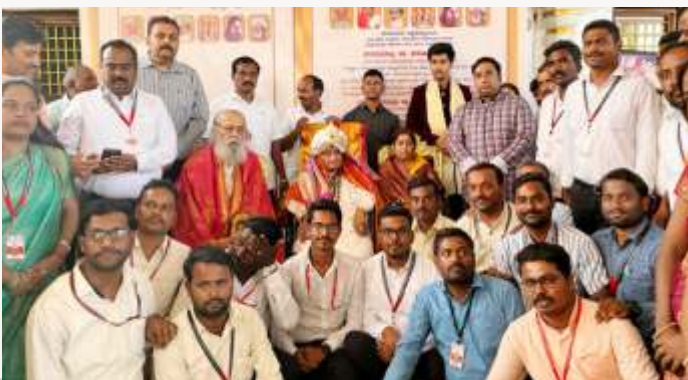
On 07th Dec 2022, Sri Sharanbasveshwara Vidya Vardhak Sangha's Group Institutions of Shorapur have grandly welcomed the "KANNADA TERU" vehicle which is running towards Haveri for Kannada Sayitya Sammelana.