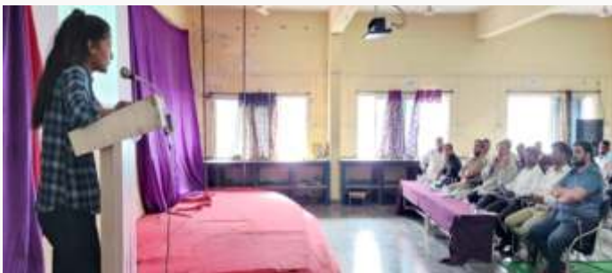
Student of ECE dept presenting business idea at SHARP THINK EVENT during Jnanamanthan Technical fest at VNEC, SHORAPUR 2021