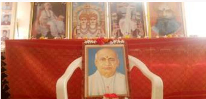
On Oct 31, 2022, Celebrated National Unity Day in view of Sardar Vallabhbhai Patel Birth anniversary