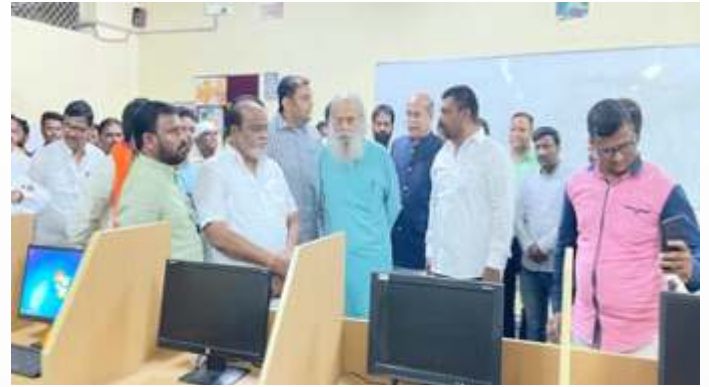
On 13 th Feb 2022, "Opening Ceremony of Innovation & Incubation Centre & Youth Employment program By TCS under CSP"