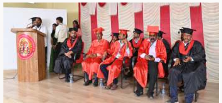
On 25th July 2022, Organised a Graduation Day for BE & MBA Final Year out going Students & Distributed the awards and prizes to Academic Excellent Students.