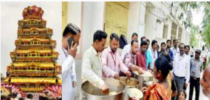
22nd March 2022, Sri Sharanabasaveshwara Jatra mahotsava /Dasoha seva