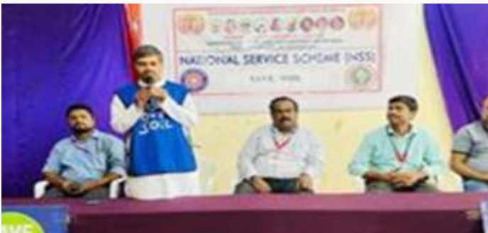
On 11th July 2022, Organised a Save Soil & Save Nation awareness program under NSS Banner by Isha Foundation.