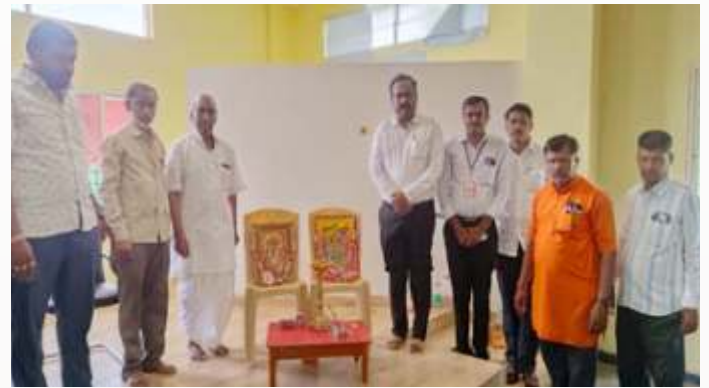
6th May 2022, Celebrated 108th Kannada Sayitya Parishat Stapana Divas