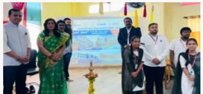
On 24th August 2022, Veerappa Nisty Engineering College, Shorapur has organized Workshop on Entrepreneurship & Innovation, (ELEVATE KALYAN KARNATAKA-BOOT CAMP) The Karnataka Digital Economy Mission (KDEM), as part of its Spoke-share Strategy' to attract companies to set up operations in Yadagir