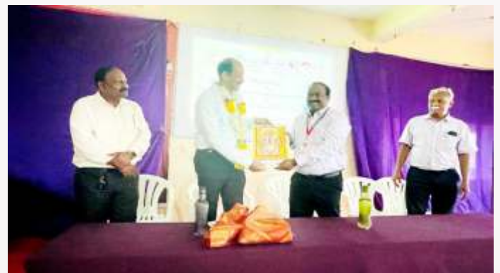
On July 8, 2022, As part of the Entrepreneurship Development Program (EDP) Laghu Udyog Bharati-Karnataka in association with Veerappa Nisty Engineering