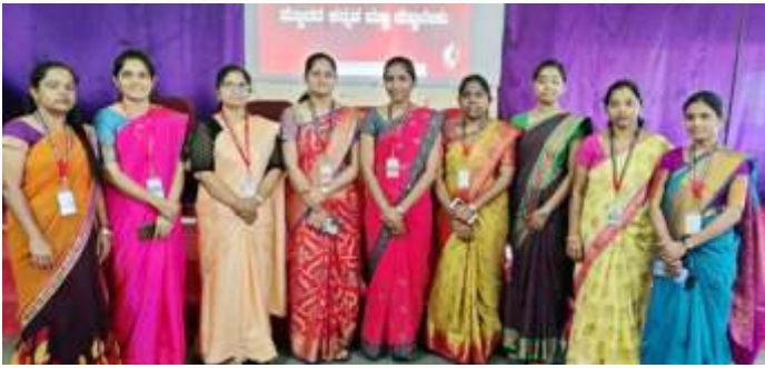
On 28th Oct 2022, Organised Koti Kanta Gayana, Nanna Nadu Nanna Hadu by playing State Anthem songs.