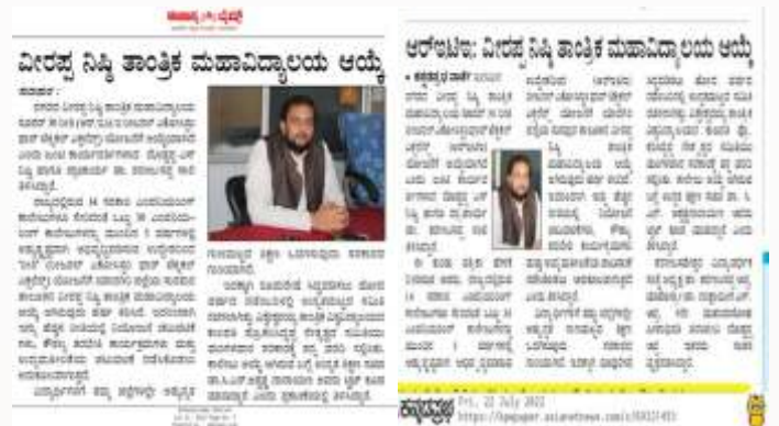
On 19th July 2022, Veerappa Nisty Engineering College, Surpur Recognised under SUPER-30 RETE Scheme by Government of Karnataka.