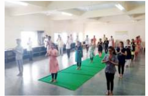
World Yoga Day Tuesday, 21 June 2022