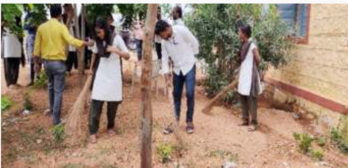
On 5th June 2022, Organised Environmental Day under NSS Banner (Swachata Abhiyan & Tree Plantation Activites by Students).