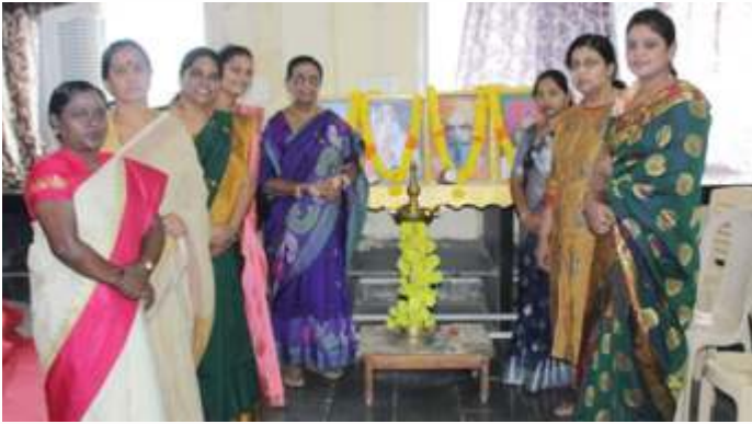
On 8th March 2022, International Women's Day Celebration.