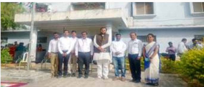
On 26 th Jan 2022, "Republic Day Celebration"